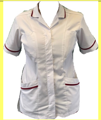
Student Radiographers & Apprentices