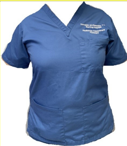
Radiology Department Assistants