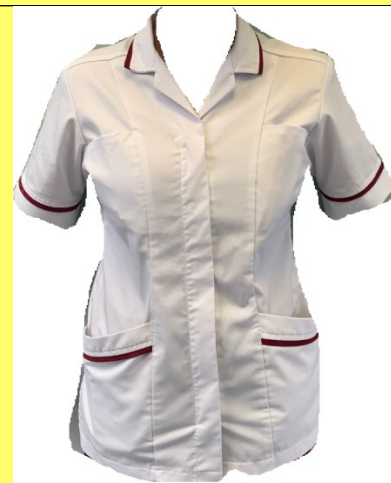
Student Radiographers & Apprentices