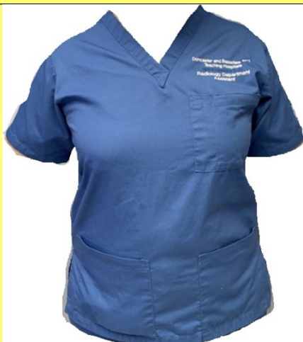
Radiology Department Assistants