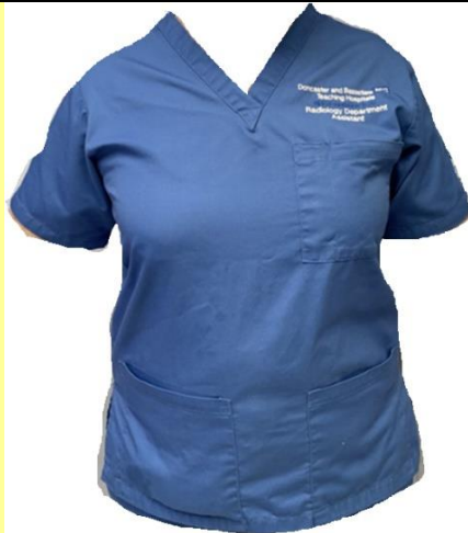
Radiology Department Assistants