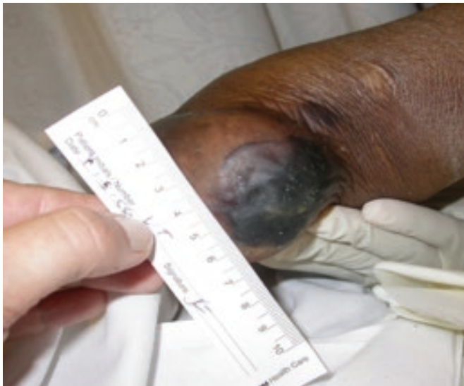
Figure 3 Ensure image is sharp and well-focused.