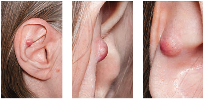
Figure 5: Images at different angles are useful for raised lesions.