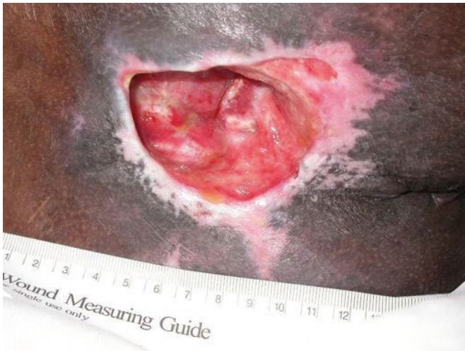
Figure 1: Example of single use measure