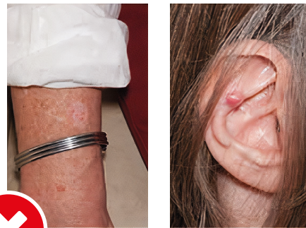
Figure 4 Move distracting items.