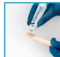
With a spatula