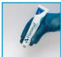
Directly from the tube