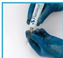
With a syringe