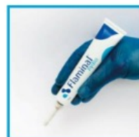
With a nozzle