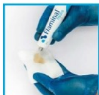
Directly onto the dressing